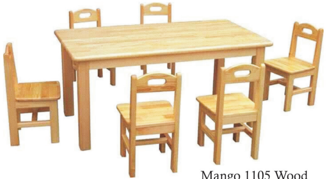
Mango 1105 Wood