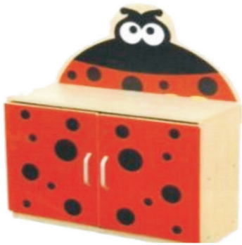
Lady Bug Storage