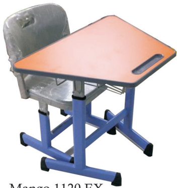
Mango 1120 EX