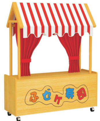
Pretend & Play Theatre