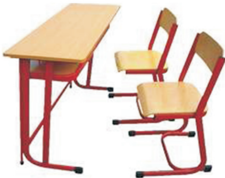
Mango 1040 (D)