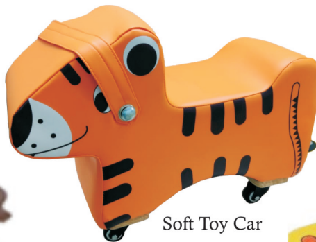
Soft Toy Car