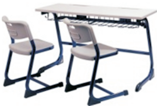
Mango 1032 (D)