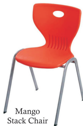
Mango Stack Chair